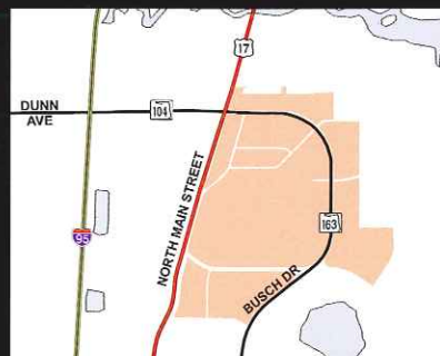
Imeson Industrial Park