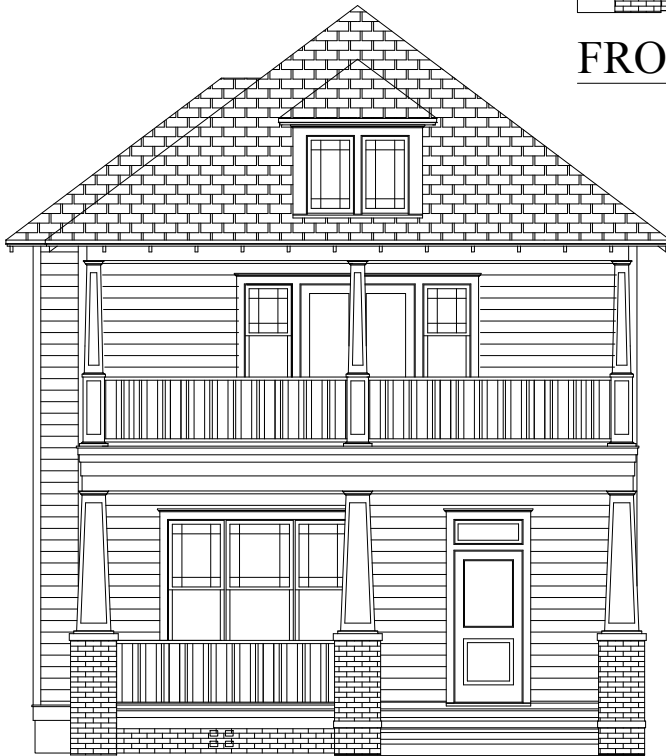
FRONT ELEVATION DORMER

In the interest of continuous improvement and to meet the changing market conditions, the builder reserves the right to modify the plans, specifications and products without notice or obligation. Actual dimensions may vary.