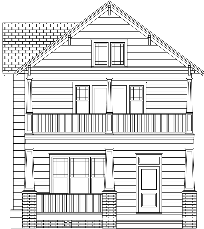
FRONT ELEVATION GABLE